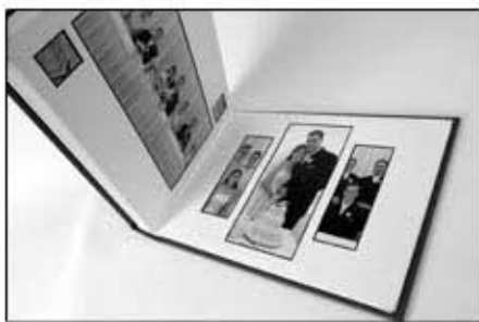
2 Multiple aperture album

2 Multiple aperture albums: eg. Jorgensen albums. This is a modern - looking yet more traditional album in its approach, whereby each photograph has its own individual 'window' within a card mount,